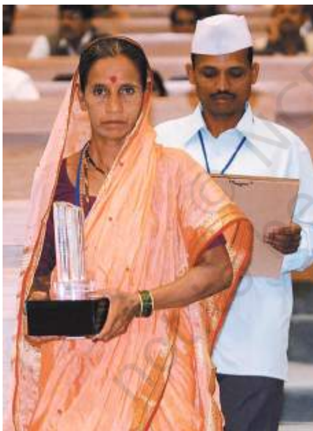
Two village Panchs from Maharashtra who were awarded the Nirmal Gram Puruskar in 2005 for the excellent work done by them in the Panchayat.

In some states, Gram Sabhas form committees like construction and development committees. These committees include some members of the Gram Sabha and some from the Gram Panchayat who work together to carry out specific tasks.